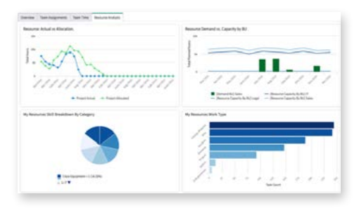
View resource planned vs. actual allocations and demand vs. capacity.