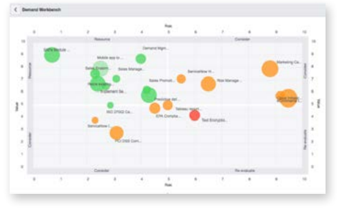
Centralize, collect and prioritize all demand; assess by cost value and risk.

Many organizations have multiple, standalone tools for tracking software development and projects, creating a disconnect between enhancements and fixes. Agile Development solves that problem by managing scrum, waterfall, or mixed development efforts and defining tasks required for developing and maintaining software throughout the lifecycle—from inception to deployment. Your visibility into the development lifecycle is increased and reported across development teams.